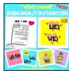
Secret Stories® FLASHCARDS #2021DFC $47.50