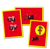
Secret Stories® SPACE SAVER #2015P $72.50