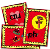
Secret Stories® FUN & FUNKY #2013F $75.00