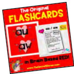
Secret Stories® FLASHCARDS #2018C $42.50

Brain-Based red, cards - 6" x 6" in size, a Secret Stories® graphic on the front, the "abridged" story text on the back.