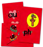
Secret Stories® ORIGINAL #2013O $70.00

*Please Note: DO NOT purchase this item if you do not already own the book with the musical brain teasers - "secrets" (sound stories) are not included.