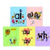
Secret Stories® DECORATIVE SQUARES #2018DS $85.00